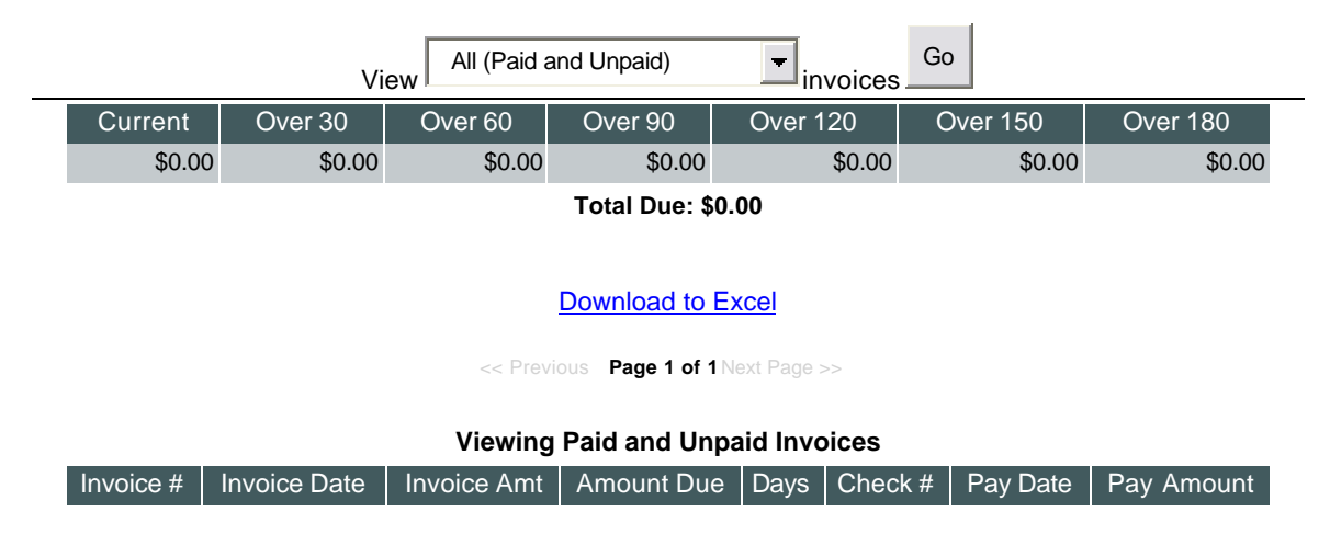
There are no invoices to show in this view